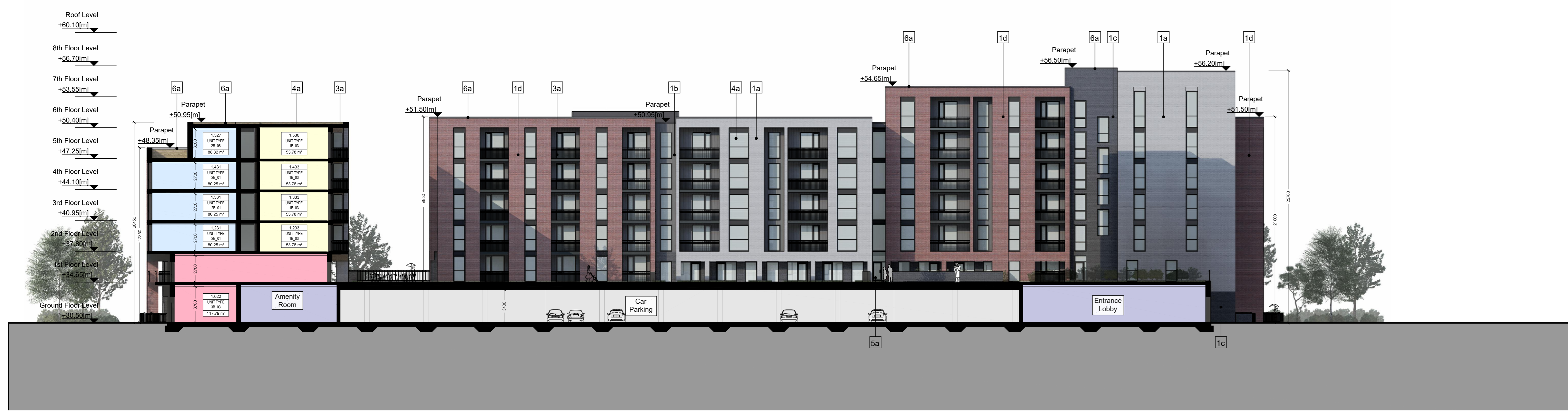
03 - Courtyard West Elevation - Block 1 Scale 1:200 @A0