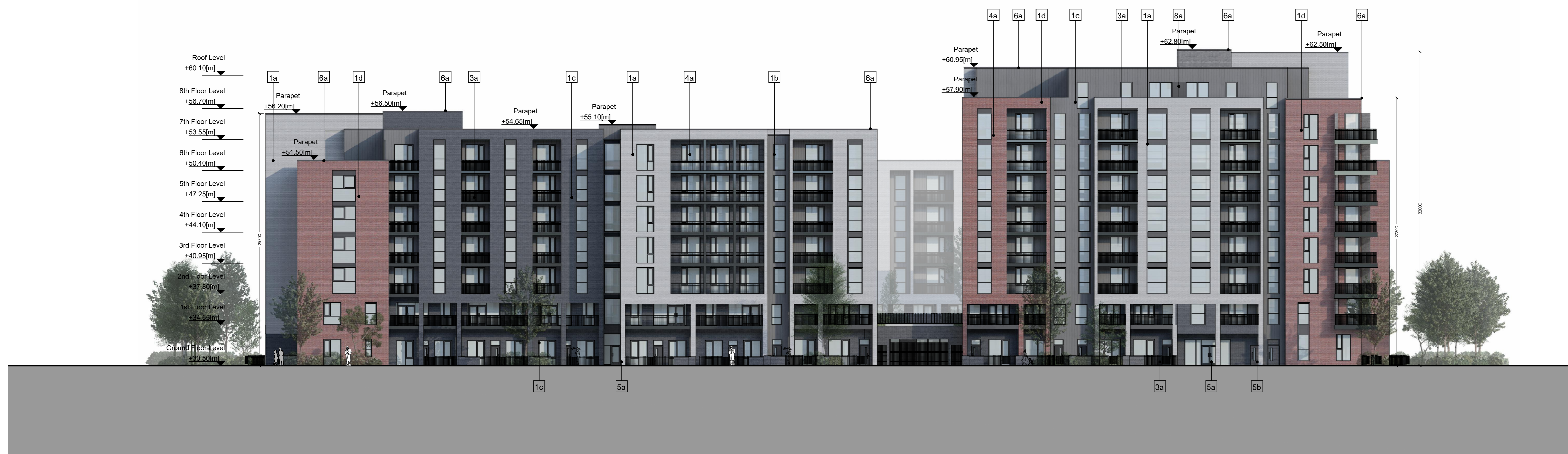
01 - West Elevation - Block 1 Scale 1:200 @A0