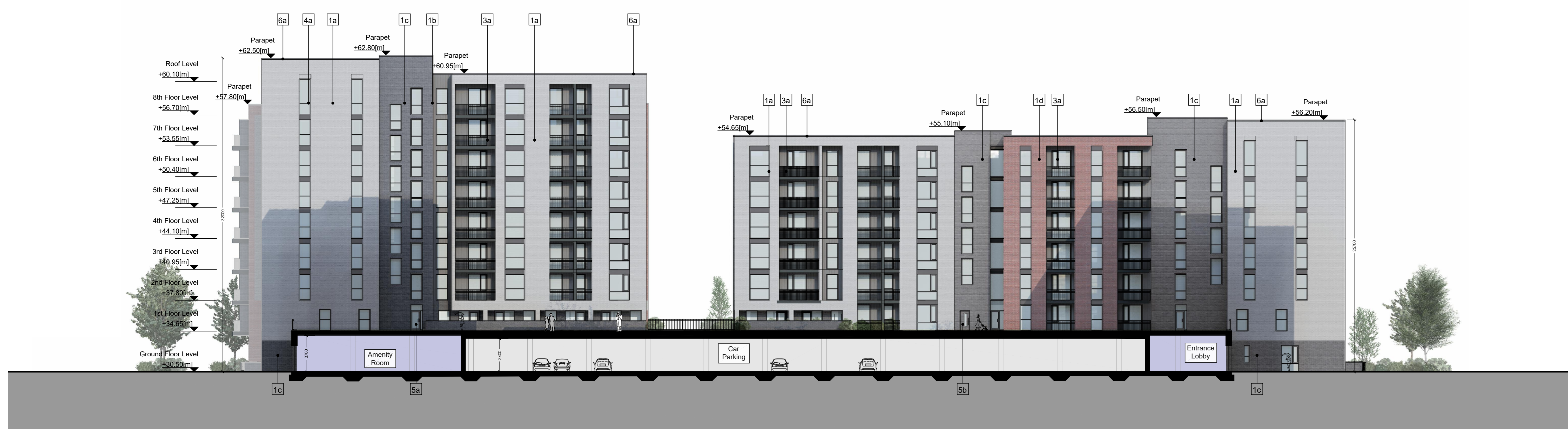
02 - Courtyard East Elevation - Block 1 Scale 1:200 @A0